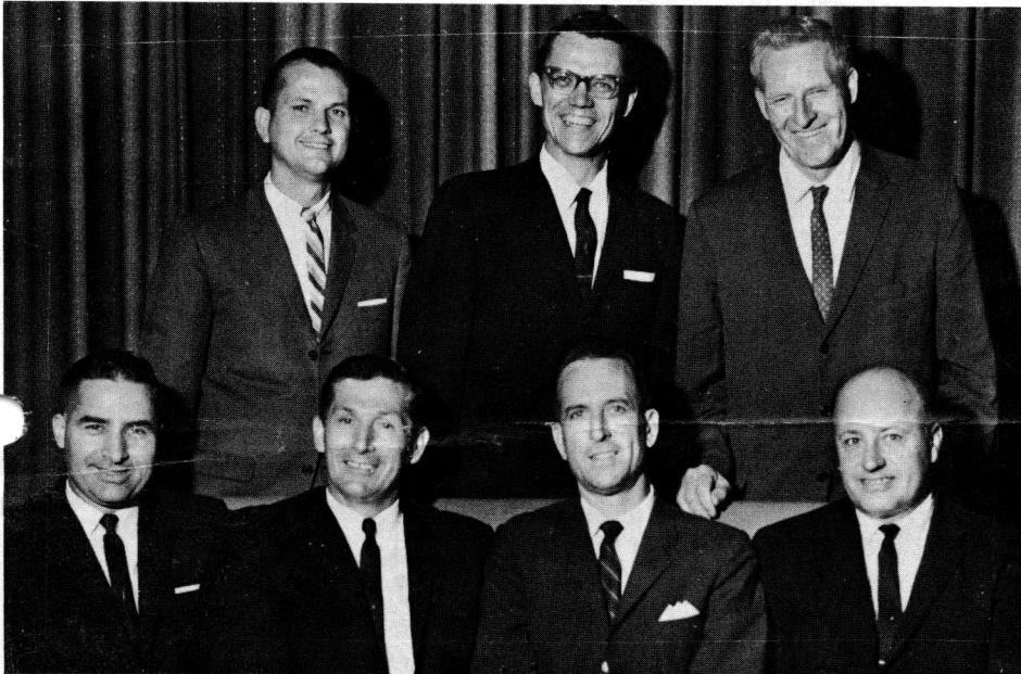
NEW SPOKESMAN CLUB OFFICERS—CHICAGO AREA